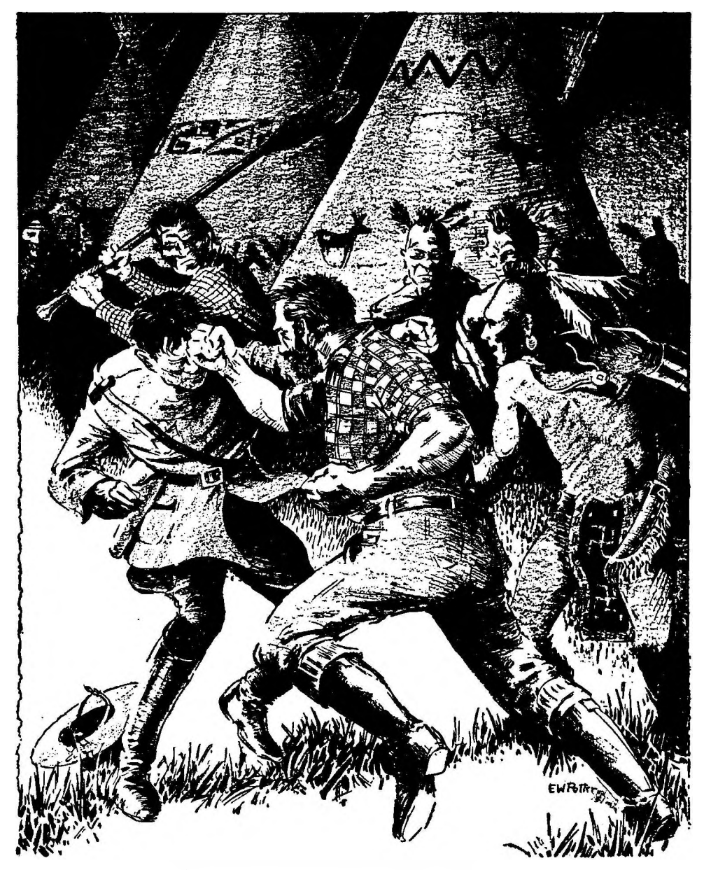
Carnes staggered from the shocking blows.

Burke and Carnes were carrying scarlet-tunic law into the red man's wilderness—straight into a long-knife doom set by a renegade white.