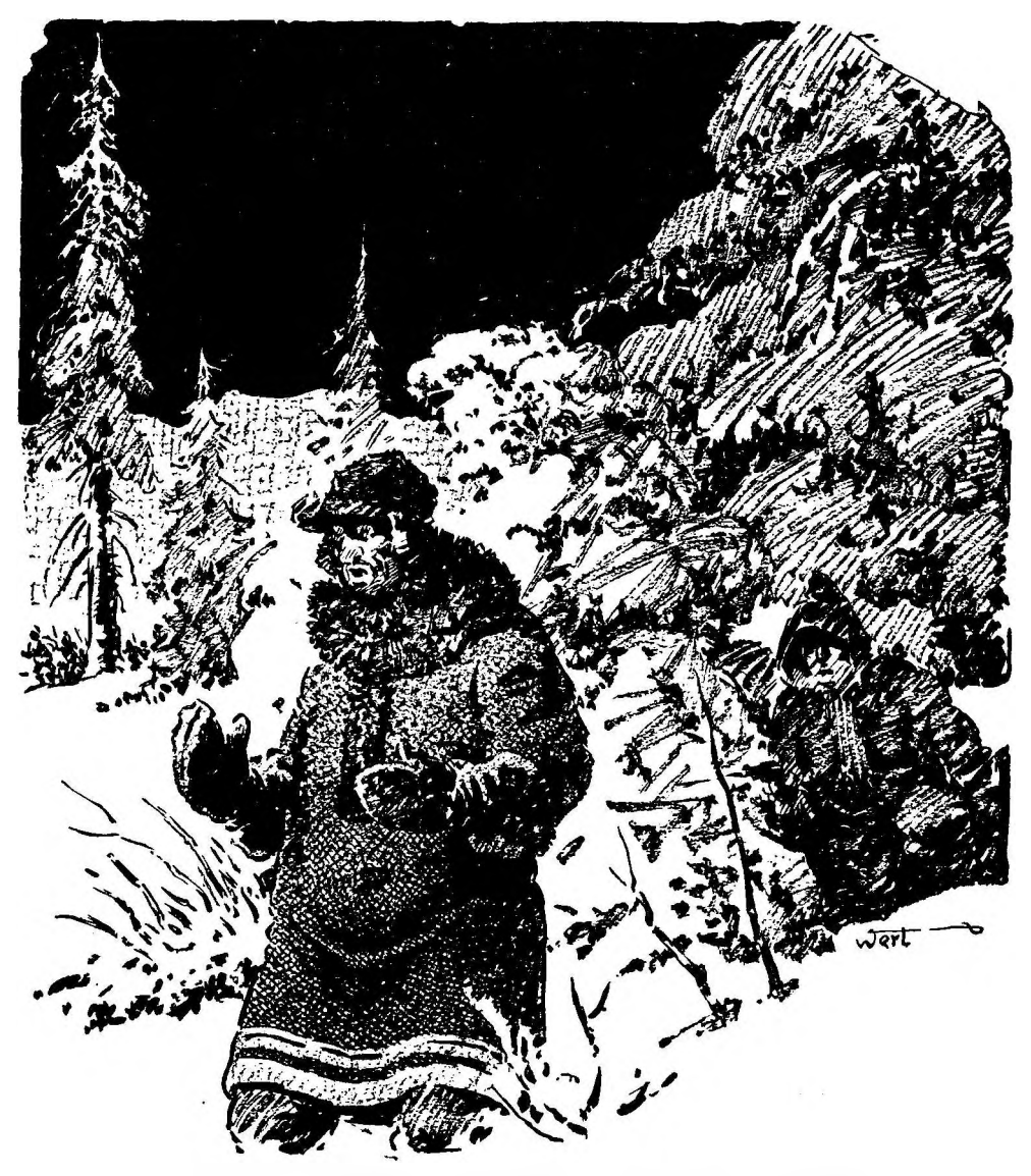
Wandel cowered back—squarely into a bushwhacker's bullet!

Dawson was the toughest town in the Klondike, and Duke Wandel was its trail-mask king. Chechako Jeff Barnes invaded that stronghold of plunder trail for a stolen kiss from a golden girl—and murder-hell broke loose on the frozen streets.